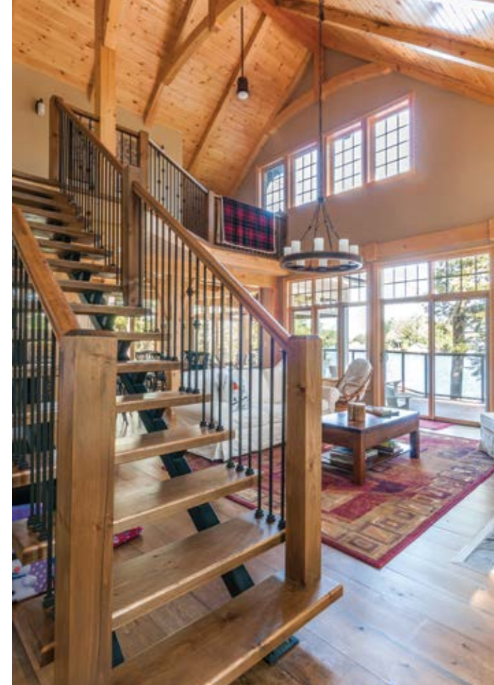
LEFT: An open-tread pine staircase leads to the second-floor loft and bedrooms. BELOW: Ed Blekkenhorst (centre) built the Discovery Dream Homes cottage for Henrietta and Harry Reinders. BOTTOM: Soft Swedish-styled furniture makes comfy seating in the great room of the lake house. OPPOSITE: Large wood-framed windows flank the split-boulder fireplace and its antiqued mantel.