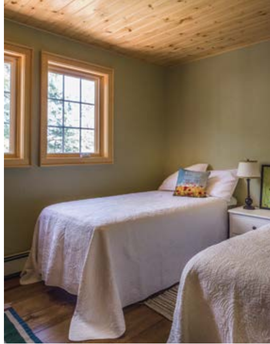
LEFT: Quiet and comfortable, the second-floor cottage bedrooms are simply furnished. FAR LEFT: The couple's daughter Shannon painted wooden chairs with engaging axioms for the cottage. This one says, "Be happy, like a bird with a french fry." BELOW: Sliding doors, salvaged from the original boathouse, were refinished and repurposed in an upstairs bedroom where they reveal a tiny space for a crib.